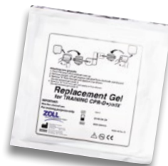
Replacement Adhesive Gels for CPR-D-padz Trainer Electrodes Part# 8900-0803-01

(Replacements must be ordered separately)