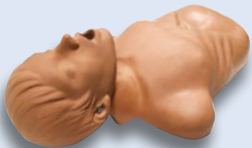
AED Plus Trainer Demo Manikin Part# 8000-0835-01