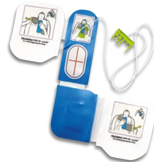
CPR-D-padz Trainer Electrodes Part# 8900-0804-01