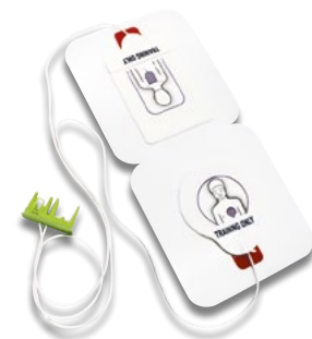
Pedi-padz® II Trainer Electrodes Part# 8900-000861-01 (case of 6)