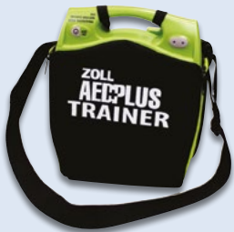
AED Plus Trainer Carry Case Part# 8000-0375-01