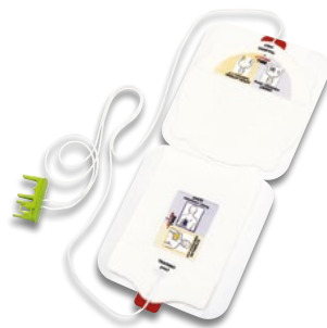
Stat-padz® II Trainer Electrodes Part# 8900-0805-01 (case of 6)